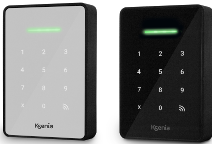
KS12100031.302 - ergo-X black KS12100031.303 - ergo-X grey